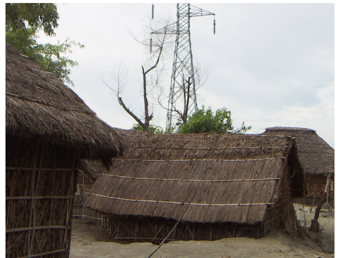
Damaged Transmission Line

Hence, India did not deem it "necessary to involve Bangladesh on the consideration of the Kosi Project." Due to Kosi's proximity to her, Bangladesh perceived the Kosi multipurpose project as a regional project to partner in. During Prime Minister G.P. Koirala's infamous visit of December 1991, India ensured that, among a host of Indo-Nepal water resources issues, the joint study of the Sapta Kosi High Dam Multipurpose Project be carried out expeditiously with a joint committee of experts to finalize ' the method of assessment of benefits '. 7 With India gunning for the Sapta Kosi High Dam study, Prime Minister Sher Bahadur Deuba's government in 1996 was apparently ecstatic that India agreed to include the Sunkosi-Kamala Diversion also in the study. Thus emerged the India-funded Nepali Rs 46.8 crore (Rs. 468 million) study of the Sapta Kosi High Dam