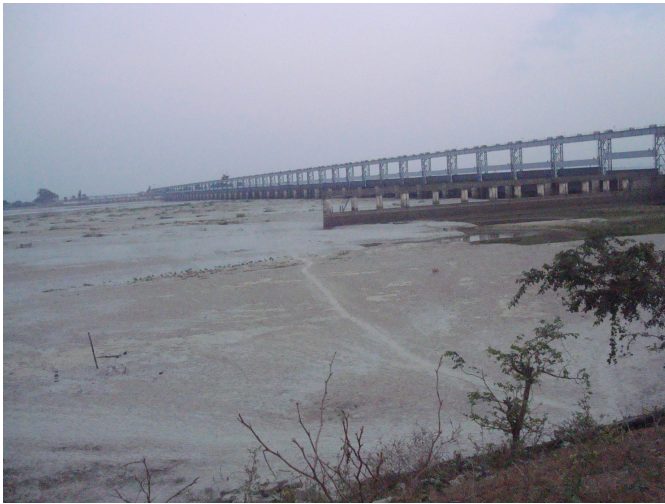
Dry Kosi Barrage

impending catastrophe that the Birpur Chief Engineer was warning about for two weeks? Surely, the nation that exploded the nuclear device and orbited a lunar module did not default on purpose?